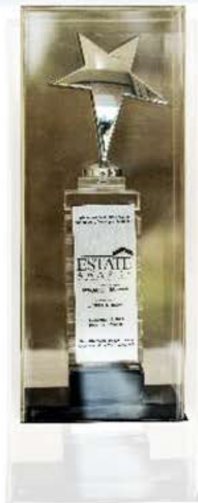
Best Affordable Budget Housing Developer 2013