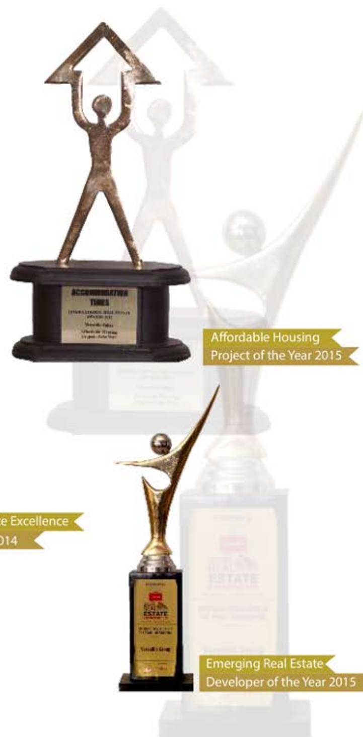
Affordable Housing Project of the Year 2015