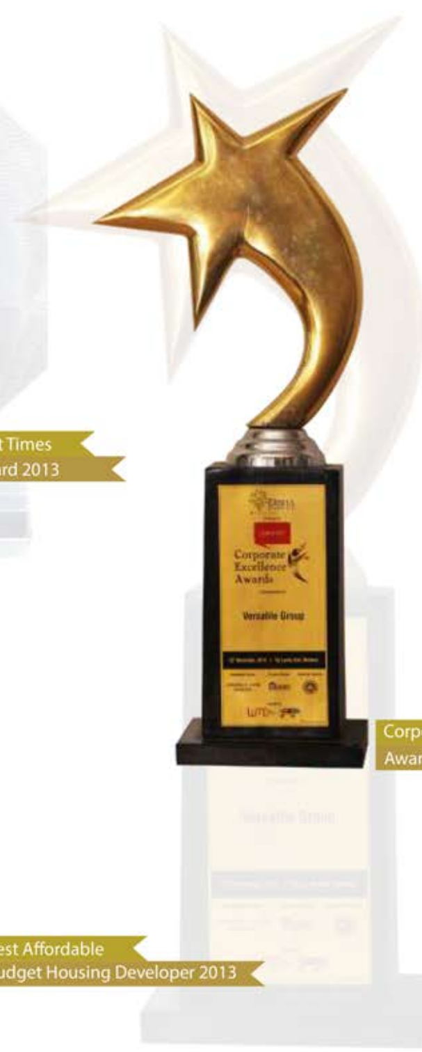
Corporate Excellence Award 2014