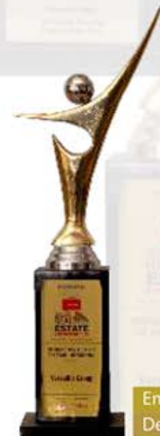
Emerging Real Estate Developer of the Year 2015