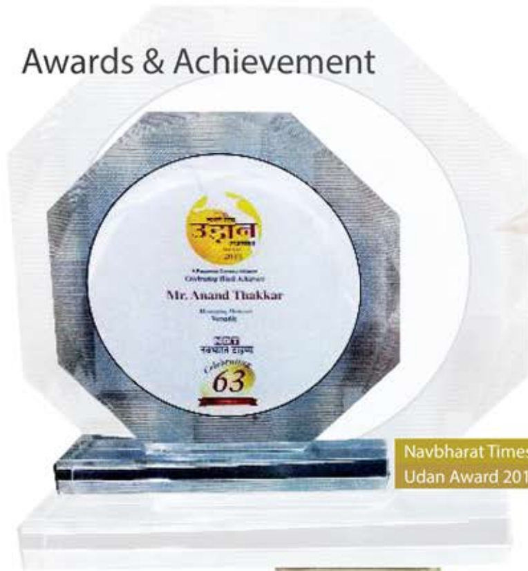
Navbharat Times Udan Award 2013