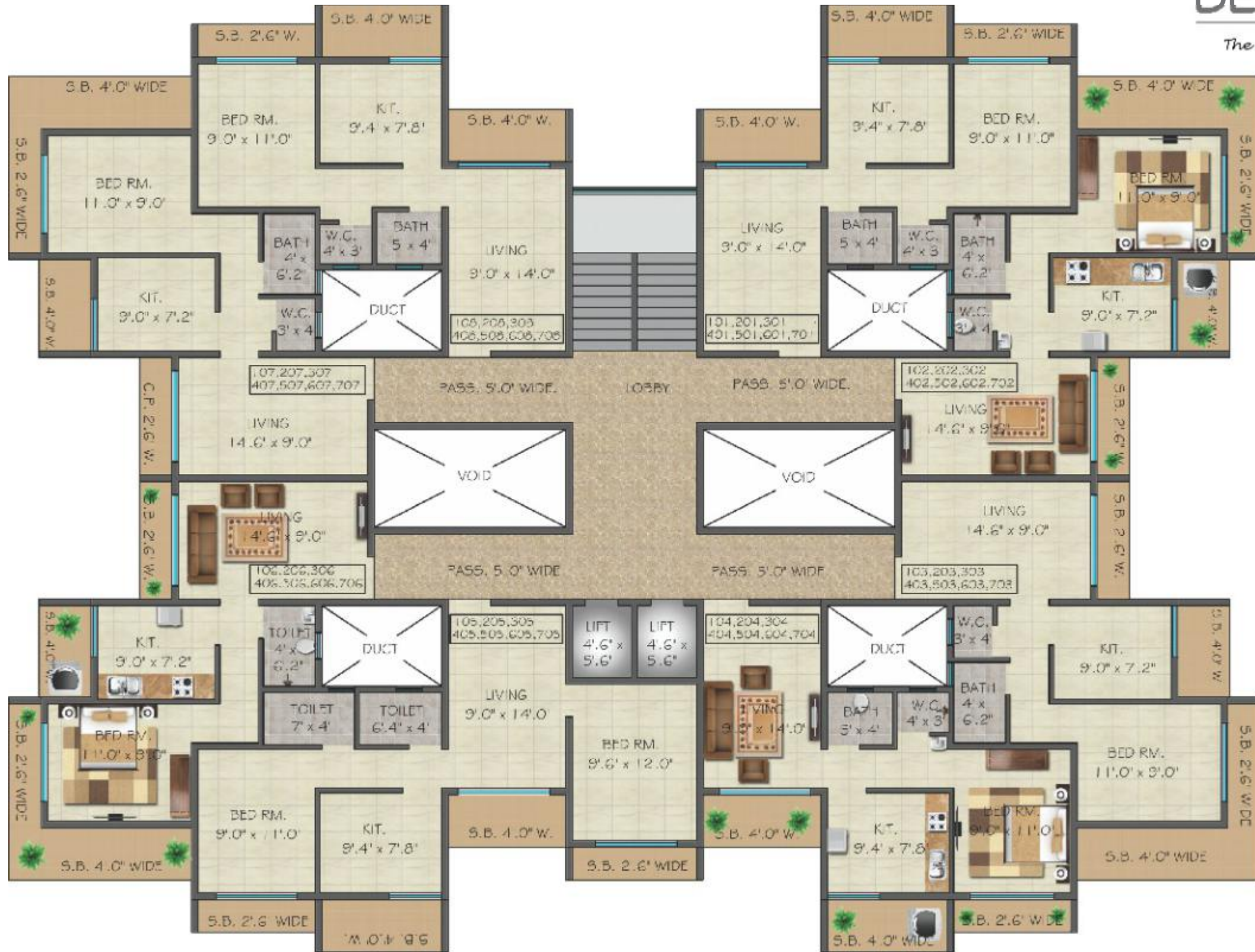
FIRST TO SEVEN TYPICAL FLOOR PLAN